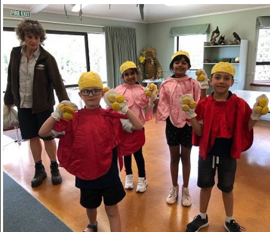
'Flowers' waiting to be pollinated

Year 2 and 3 pupils took part in hands-on learning at the Auckland Botanic Gardens on Thursday. Year 3 students learnt about the parts of a flower, the pollination process and also planted their own marigold seeds. We hope to see these seeds grow in the next few weeks! Thank you parents for your help on this outing. Year 0 and 1 pupils will visit the Gardens on Thursday.