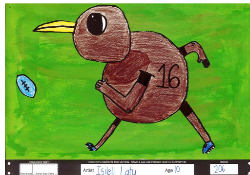
An example of Kiviana art that students in Room 206 drew for their calendars.